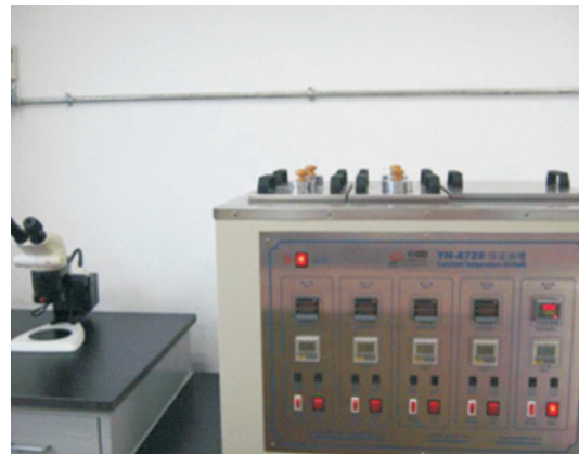
● 耐油测试 Oil resistance test