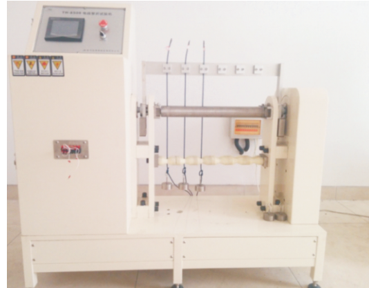
● 弯曲测试 Bend test