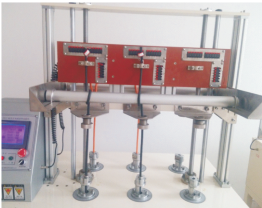
● 扭转测试 Torsion test